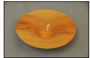
Aaron Gesicki Sugar Maple Wipe-on Poly