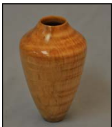
Lance Zook Curly Maple Sanding Sealer