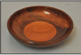
Vernon Hollatz Cherry/Walnut Poly