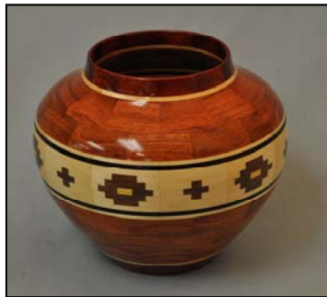
Bill McQuitty Bubinga, Maple, Walnut, Bloodwood Wipeons