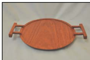
Lloyd Beckman Walnut Root, Cherry, Maple, Deft