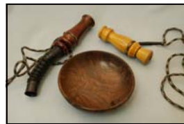
Dan Schladt Walnut Cocobolo Osage Orange Myland Wax