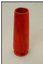
George Oliver Cherry Tung Oil / Stain