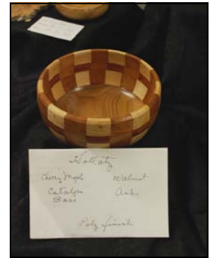
Vernon Hollatz Maple/ Walnut /Ash Poly