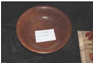
Warren Hadley Walnut