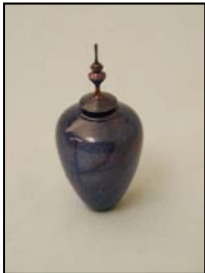
Kelly Bissel Box Elder Air brush/Poly