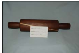
Art Jackson Walnut/grey elm Mineral Oil