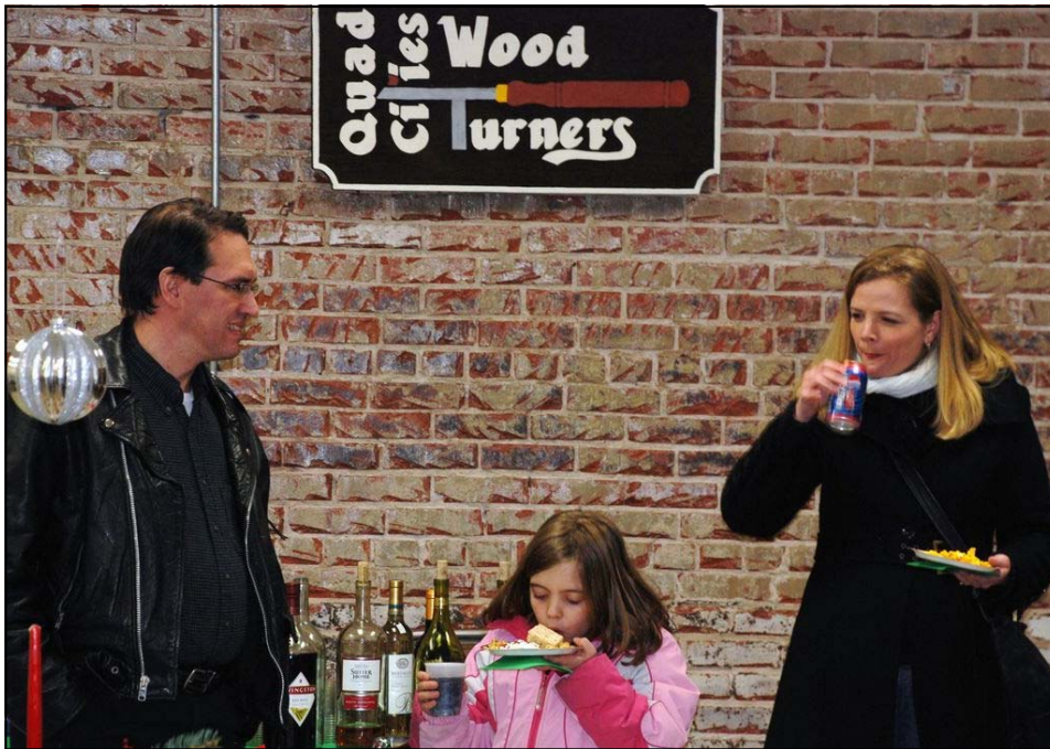
Some of our Gallery guests enjoying Holiday refreshments at our December Gallery Hop, the first in our new DeSoto Arts location.