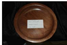
Carl Smith Walnut Deft