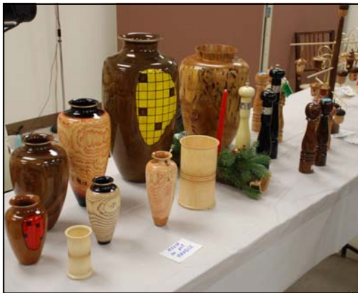
Some of the many items on display for the Gallery Hop.