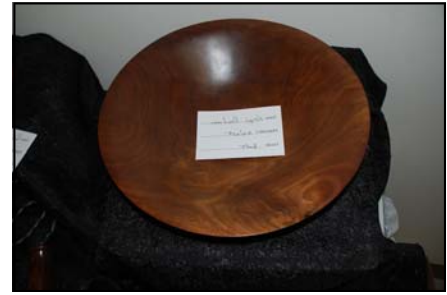
Lloyd Beckman Walnut Deft