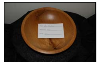
Art Jackson Oak Oil