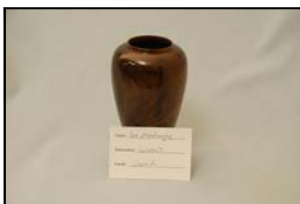
Joe Meirhaeghe Walnut Varnish