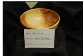
Gene Vincent Eastern Red Cedar