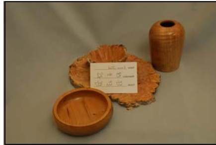
Lance Zook Maple Burl Cherry Curly Maple Sanding sealer Pen Polish Sanding Sealer