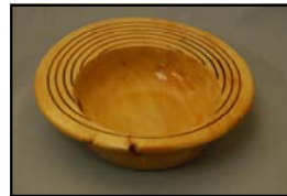
Tom Viscioni Box elder Poly