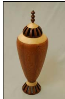
Roger Viager Walnut/sycamore Leopard wood/lacquer