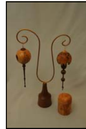
Warren Hadley Walnut