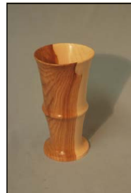
Carl Smith Pecan