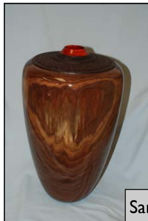
Sarge Walnut Varnish