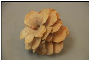
Gina Swift Pacific Madrone Unfinished