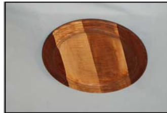
Jon Curtis Walnut/Maple Wipe on Poly