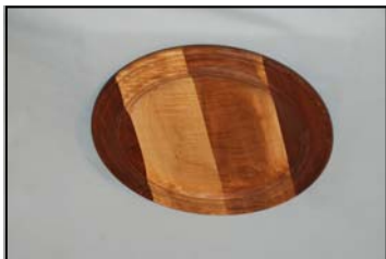
Jim Brooks Oak/ Cherry (below)