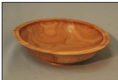
Warren Hadley Birch Tung Oil / wax