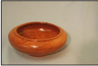
Vernon Hollatz Cherry Poly