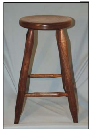
Jon Curtis Walnut Satin Wipe-on Poly