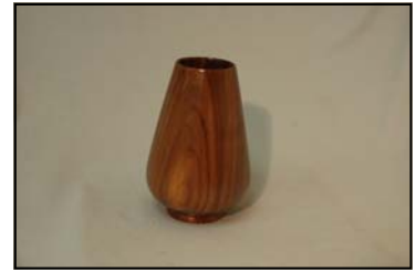
Larry DeVries Walnut Lacquer