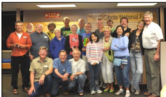
From the AAW National Symposium