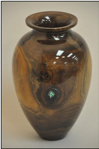
David Livingston Walnut/ Turquoise inlay Varnish