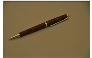
Jim Bodin Redwood Burl CA glue