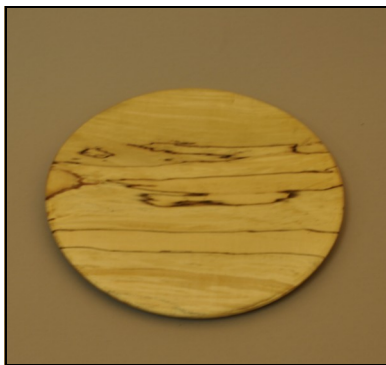
Russ Reynolds (First Turning) Spalted Maple Satin