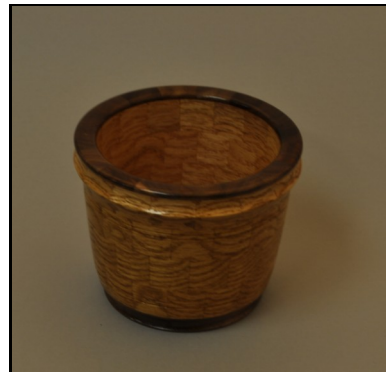
Gene Calsyn Paduak /Maple and Walnut /Oak Watco Lacquer