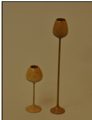
Lance Zook Maple Cherry Sanding Sealer