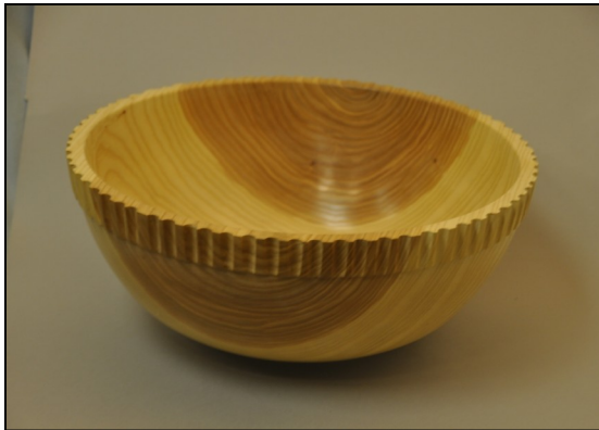
Gene Vincent Ash Satin Wipe-on Poly