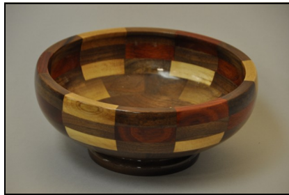
Vernon Hollatz Walnut Poly