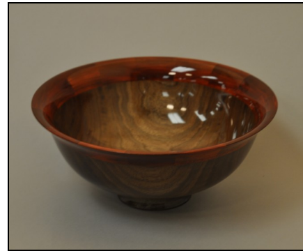
Dale Gramling Walnut Redheart Satin Wipe-on Poly