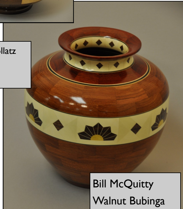
Bill McQuitty Walnut Bubinga Wipe on Poly