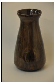
Dan Schladt Walnut Deft