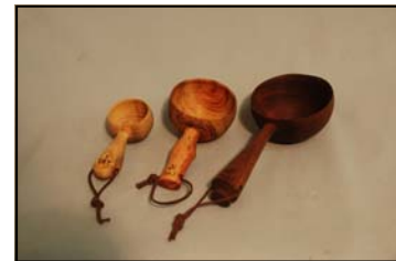
Lee Whiteside Walnut, Plum, Hornbeam Walnut Oil